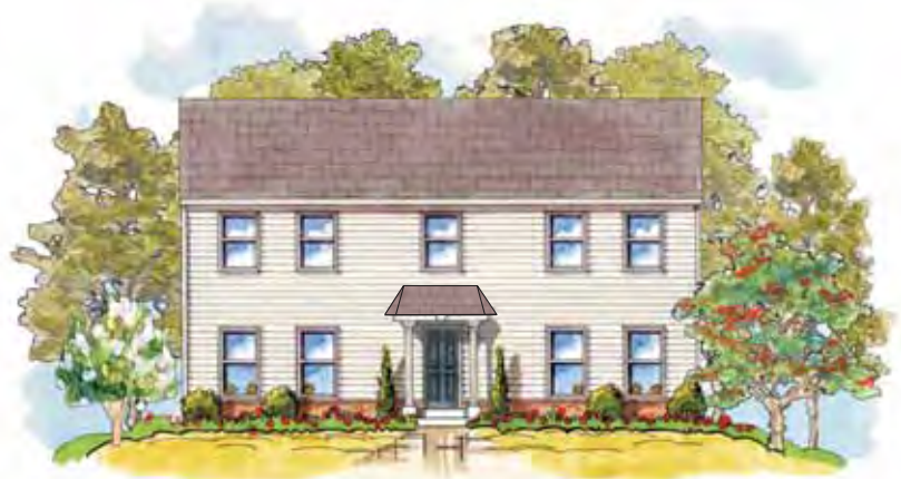
Renderings are for illustration purposes only and may include upgrade options.